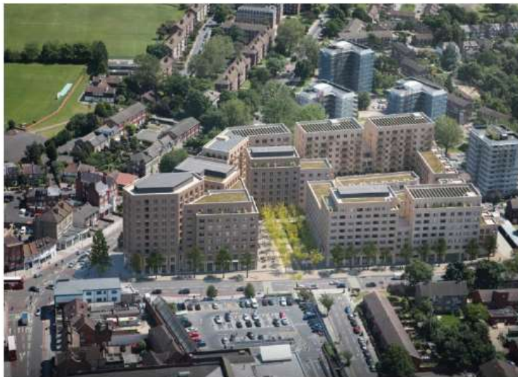
2018 Planning Application (ref. DC/18/107468)