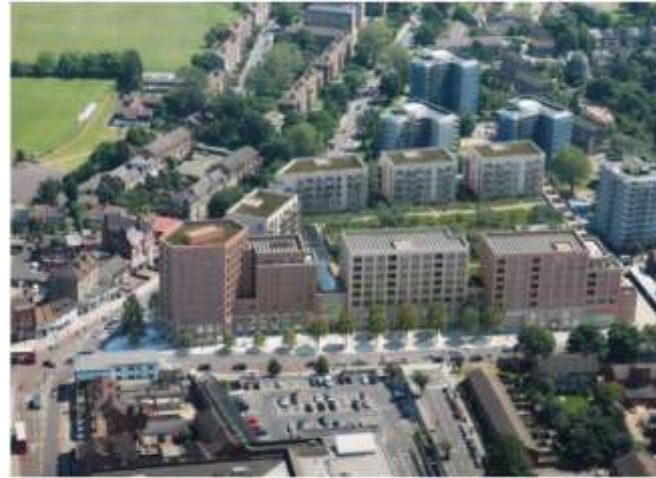
2015 Planning Application (ref. DC/14/090032)